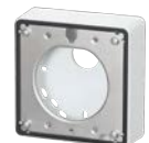
WV-QIB500-W Mount Bracket